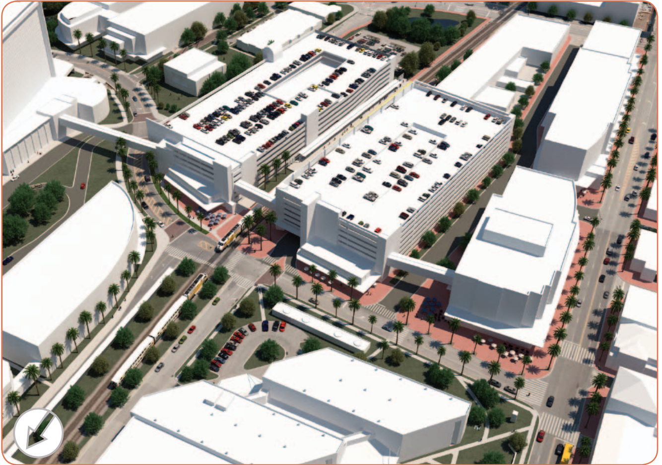
Artist's rendering looking southeast towards transit station.