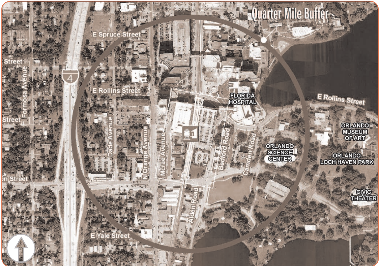
Aerial photo of existing conditions.

The master plan for Florida Hospital serves as an appropriate blueprint for introducing SunRail and TOD into the hospital's campus. Growing from 7,000 to 15,000 employees at build out, this Urban Center TOD is anticipated to become denser and more walkable over time. In addition to the information presented earlier in the report, next steps in TOD planning for Florida Hospital might include: