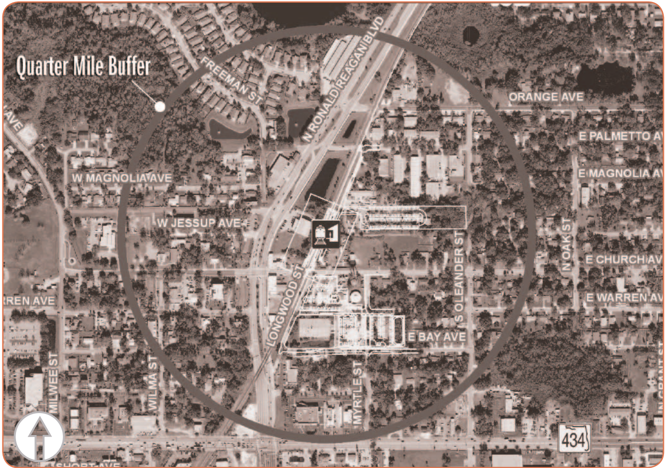
Aerial photo of existing conditions.

Church Avenue serves as a critical spine connecting Longwood’s historic Heritage Village with the SunRail station and associated TOD development to create a Village Center. Properly scaling new buildings to remind motorists they are passing through a village and making modifications to Ronald Reagan Boulevard to enhance a safe pedestrian and visual connection along Church Avenue will likely require special attention. In addition to the information presented earlier in the report, next steps in TOD planning for Longwood might include: