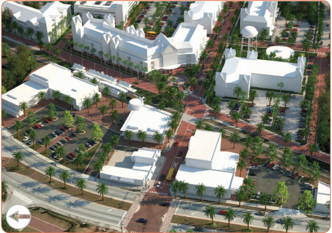
Artist's rendering looking east towards historic downtown and transit station.