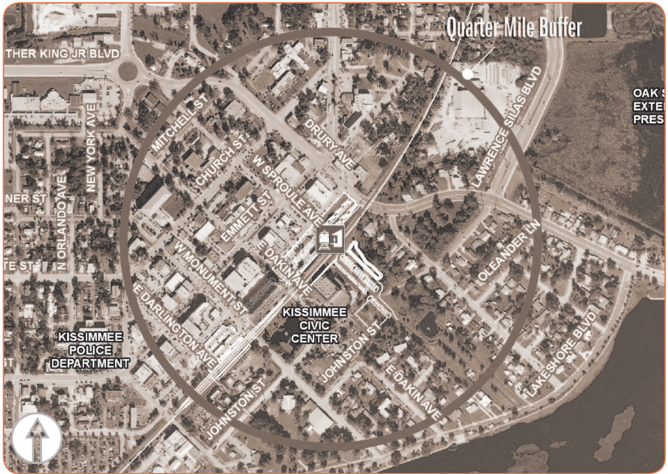
Aerial photo of existing conditions.

The coming of SunRail provides Kissimmee another tool to further the revitalization of this historic downtown. TOD needs to be understood as one piece of a broader downtown strategy. The physical ‘bones,’ planning and implementation tools are already in place for the station area to continue to grow and evolve as a relatively dense, very walkable, mixed-use transit friendly Town Center. Kissimmee’s approach to density, stormwater, housing investments and traffic calming warrants attention from other communities in the corridor. In addition to the information presented earlier in the report, next steps in TOD planning for Kissimmee might include: