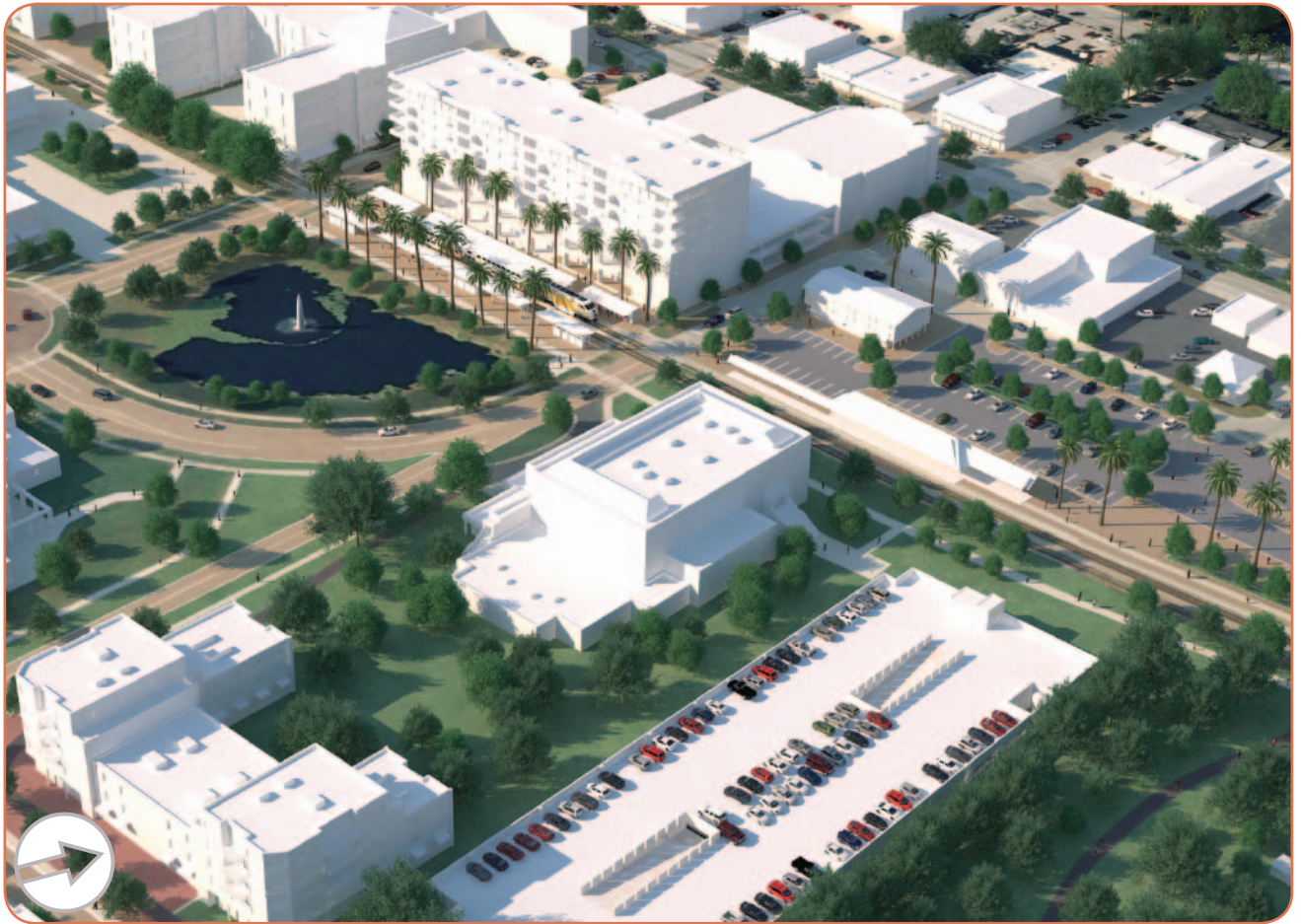
Artist's rendering looking southwest towards station.